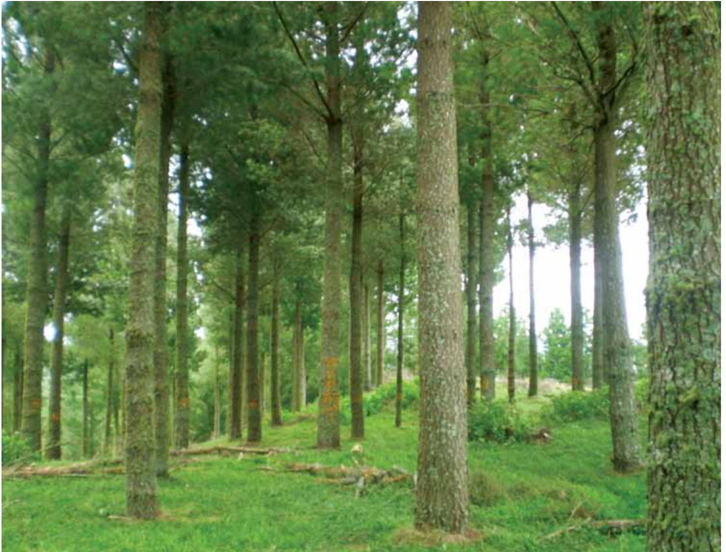
A typical Permanent Record Plot in the Gateway Forest Partnership No.36

Third lift pruning has started in Greatwood Partnership 57, approximately 110 of a total 210 hectares is scheduled to be pruned. To ensure that we achieve optimum prune heights and reduce the stress to the areas of smaller trees, the remaining pruning is scheduled to be completed later this year (November, December).